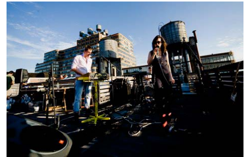
Live music before every show

Rooftop Films has been profiled in Time Magazine , The New York Times , Time Out New York , The Independent , New York Magazine , and elsewhere.