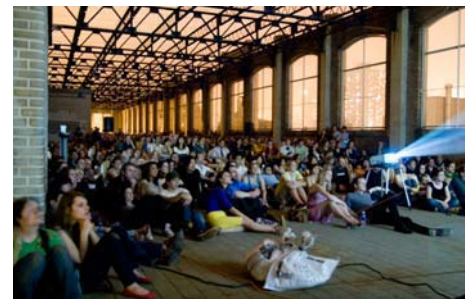
Lower East Side, Manhattan