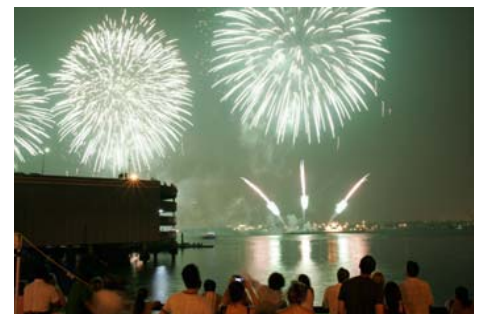
4th of July, Manhattan