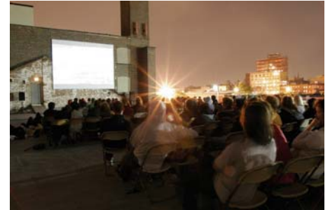
Park Slope, Brooklyn