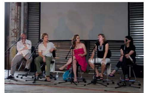
Panel discussions & Filmmaker Q&A's

CONTACT GENEVIEVE DELAURIER TO DISCUSS SPONSORSHIP OPPORTUNITIES: 718.417.7362 | genevieve@rooftopfilms.com